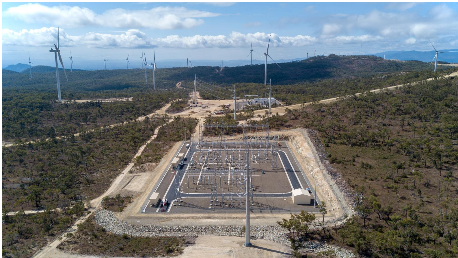
Aerial view of the Powerlink Switchyard in the foreground, with a number of turbines in the background waiting to commence operating.