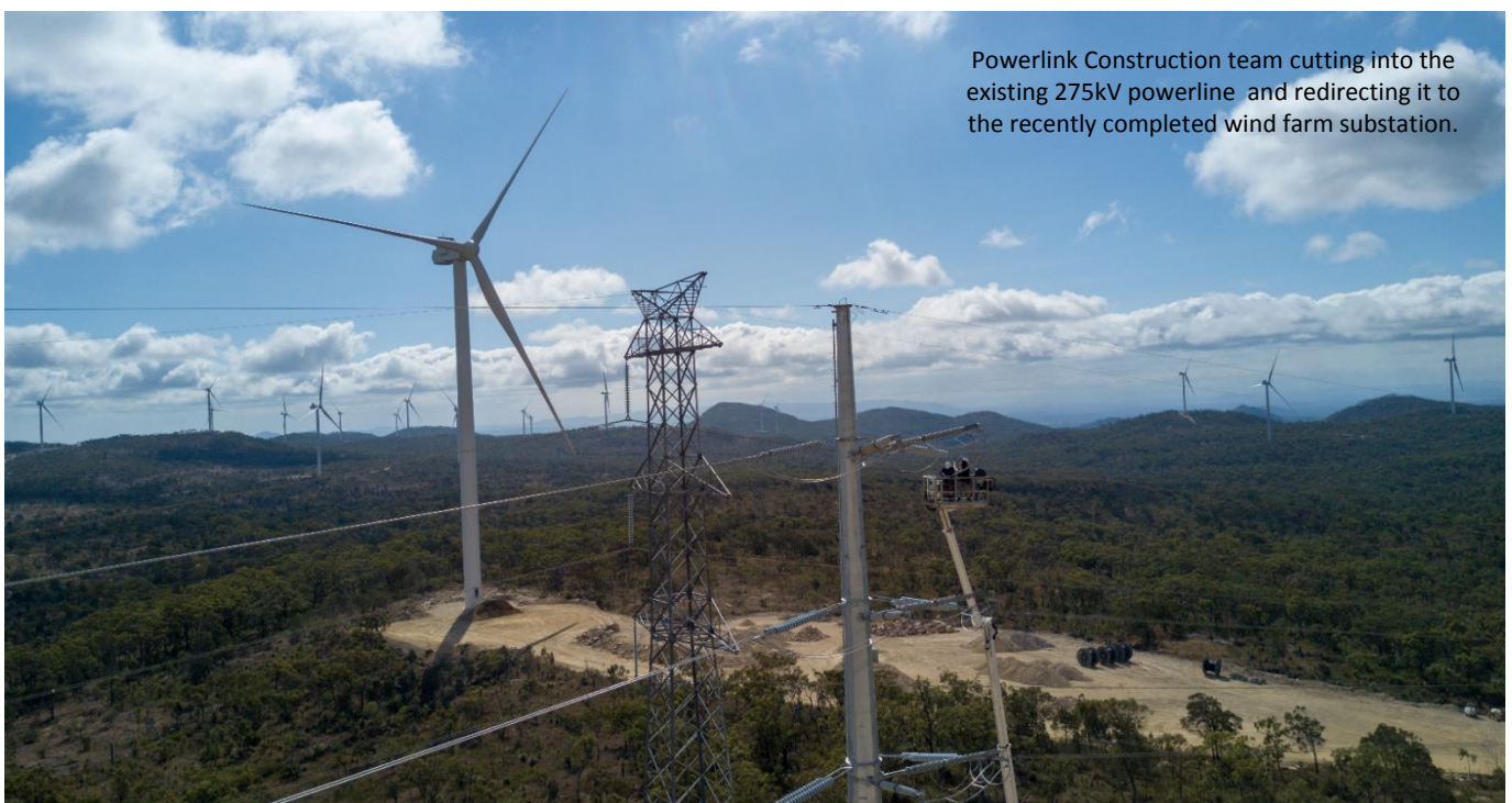
Powerlink Construction team cutting into the existing 275kV powerline and redirecting it to the recently completed wind farm substation.