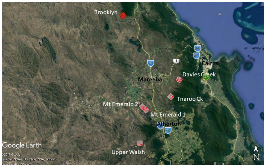
Figure 1 - Indicative locations of the six monitoring grids (red diamonds) used to monitor Northern Quoll populations in the northern Atherton Tablelands from July 2017 onwards. Monitoring site names in white text. Local place names in black text.

Trail cameras were used to collect capture-recapture and site occupancy data on six populations of northern quoll Dasyurus hallucatus (Map 1) during October-November 2017. Fifty-four individual quolls were detected (Table 1) during approximately 3000 camera trap days. Population estimates were able to be generated at two thirds (4/6) of the sites due to low numbers of spatial recaptures at 2 two of the sites. Occupancy estimates were also only able to be generated at two thirds of the sites due to very low detection rates there.