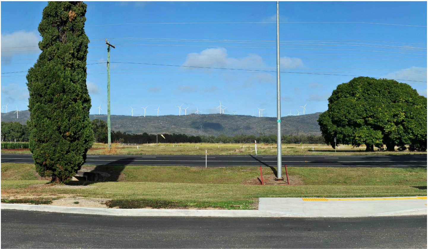
Indicative view of the proposed wind farm from the Walkamin Store.